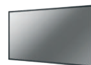
VUE-5000 Series 32"~86" full HD large format displays